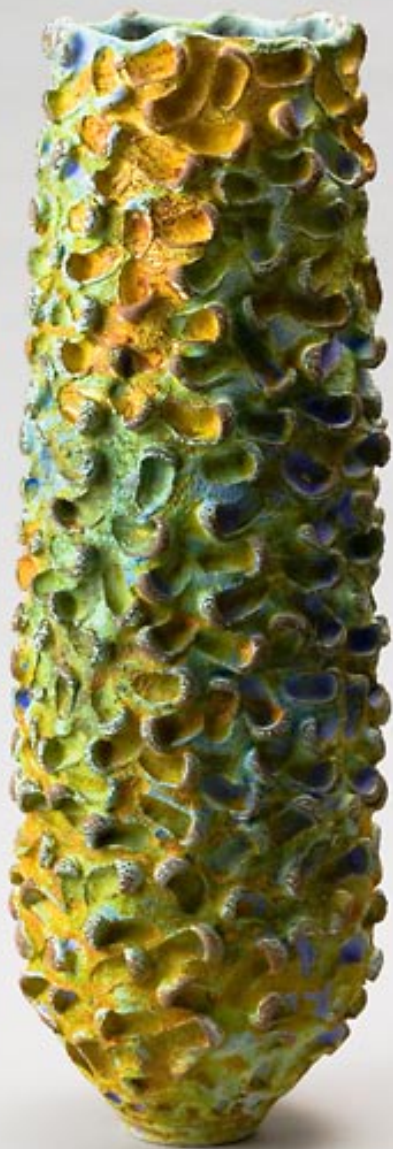
Landscapes 1, 2011, ceramic form, multilayered and fired dry glaze, 65cm h