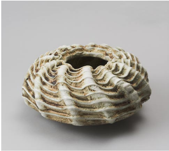
Cambrian Braille 1, 2011, ceramic form, dry glaze porcelain slip, 9 h x 17cm d