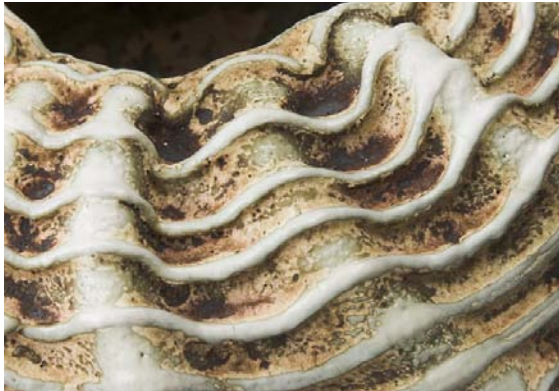
Detail of above

Touch is an important aspect of the work - the trace of the human hand, the finger mark, the scrape. It's about a context- a narrative, unfolding through its layers, while still referencing the timelessness of a tradition.