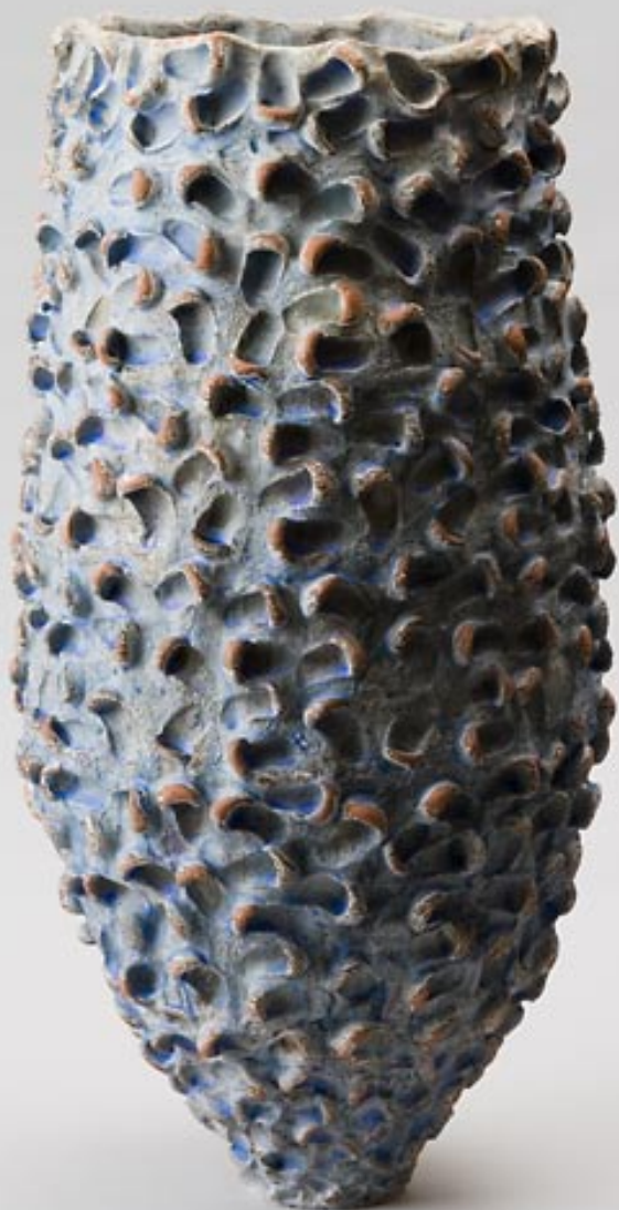
Water Mark 1, 2011, ceramic form, dry glaze mid fired, 64cm h